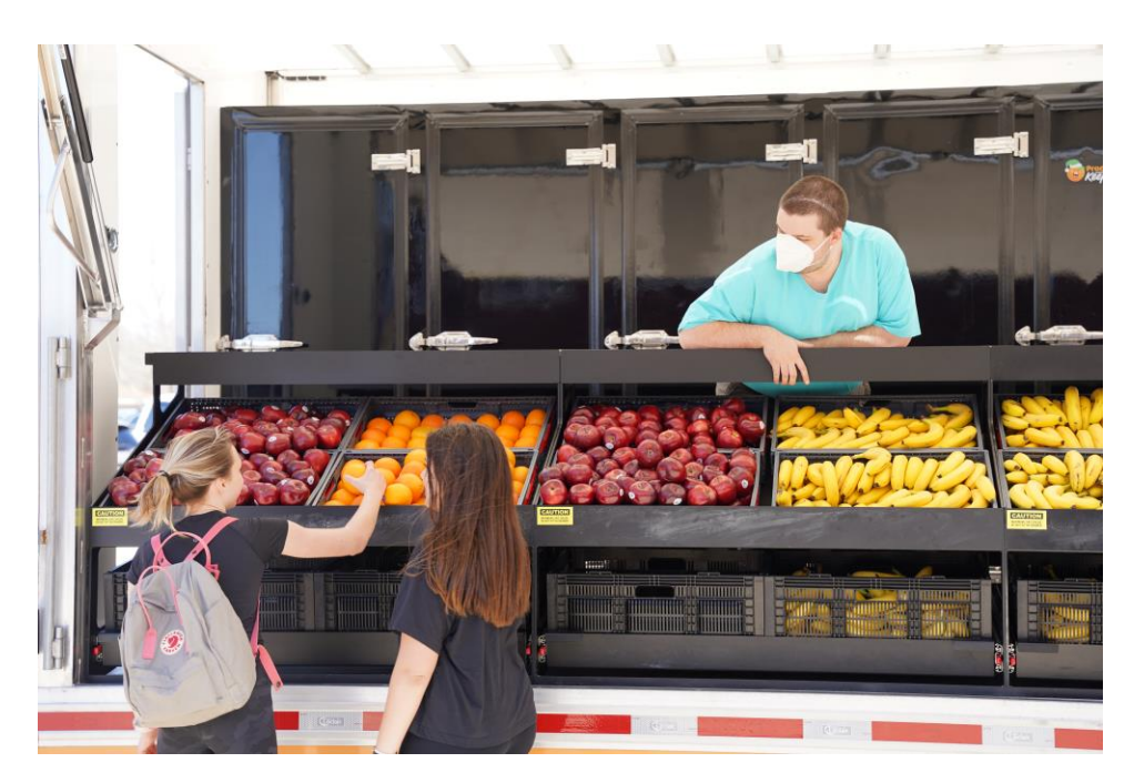
Students choose fruit from The Open Door Mobile Market Farmers Truck.